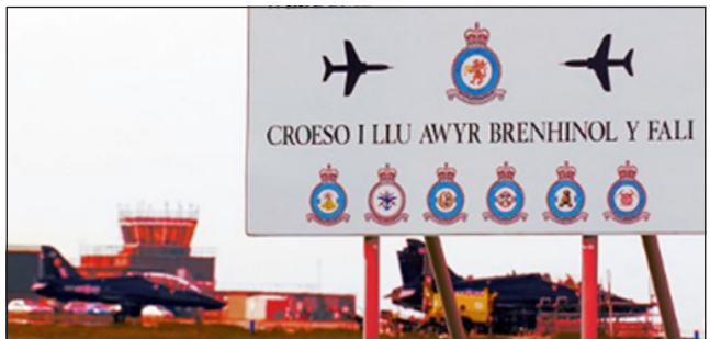
RAF Valley on Anglesey, a training base for Saudi Arabian pilots

Write to your MP to protest against unlawful and immoral arms sales to the Saudis.