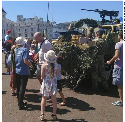
Veterans for Peace engage at Armed Forces Day in Llandudno

Veterans for Peace have also been involved in the 2018 film War School. There have been several showings across Wales and VFP-Wales members have attended to take part in the discussion. If any groups or individuals want to arrange their own screening of War School (85 mins running time, English