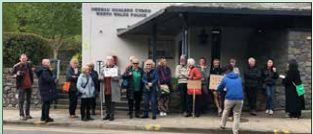
Supporting asylum seekers in Bangor, Mayday 2024.

On 1 May, with supporters of Sunak's Rwanda deportation scheme in full cry, asylum seekers were being rounded up for detention. When a local asylum seeker was asked to report to the police in Bangor , a group of supporters materialised outside the local police station at short notice. Fortunately, he was not detained. A befriending programme from the action group Dyma Ni has been working with refugees and asylum seekers in the region over the past year.