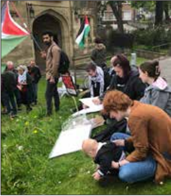
Bangor students' Gaza camp, May 2024