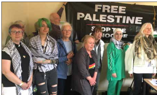
Prospects for Peace conference, Bangor, June 2024

will have calculated tactical options. An agenda for more radical, visionary changes is necessary to stop the atrophy of the body politic. A diversity of voices must be heard within political parties, across political divides and in wider public discourse. That is where CND Cymru can come in. It aims to act as a lively forum for progressive dialogue between a wide variety of individuals, political parties, trade unions and other organisations. That kind of energising interaction is needed more than ever.