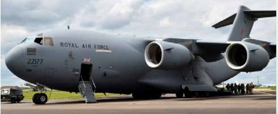
The C-17 flights are used to transport materials used in maintaining Britain's nuclear weapons.