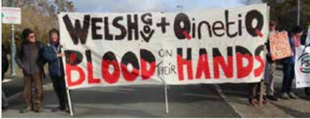
Protest at Aberporth in 2024

It is little spoken about, but Cymru is a highly militarised nation. The MoD owns 23,300 ha of our land, comprising 25 military bases. Sennybridge Training Area (formerly known as Mynydd Epynt) accounts for just over half of this.