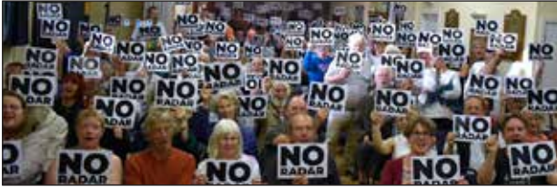
Remember 1990? Well, we're back! A packed Solva Memorial Hall, 27 June 2024.

PARC Against DARC's campaign hit the ground running with a digital launch on 29 May, featuring a high quality website www.parcagainstdarc.com , which is ram-packed with calls to action, along with social media pages, a petition and a campaign crowdfunder. The website outlines several key arguments against DARC. We