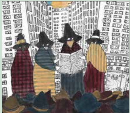
The Welsh Women's Peace delegation in America 1923

The next issue of Heddwch will be published in December 2024.