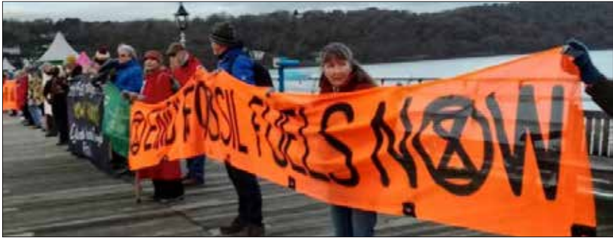
After a year of disastrous floods around the world, COP 29 convened in Baku, Azerbaijan, in November. Climate activists in Wales marked the occasion with banners on Bangor pier.