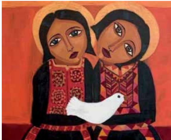
Malak Mattar: Two Gazan Girls Dreaming of Peace (2020)

Neither proposal is currently accepted by Israel. Until the outcomes even begin to be addressed, the world, including Israel itself, will remain in danger of annihilation in potentially a nuclear war.