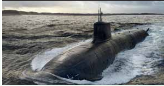
An impression of the proposed SSN AUKUS attack submarine

DARC, civil nuclear power developments and the growth of small businesses supplying the defence industry throughout Wales, all link and we need to challenge them all. In the words of previous Welsh Secretary David TC