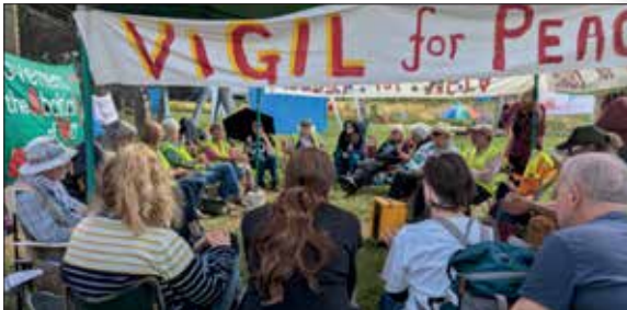
LAP holds a vigil and discussion outside the Lakenheath base LAP