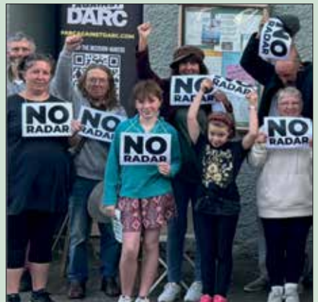
Welcoming the MoD roadshow to Pembrokeshire

The next issue of Heddwch will be published in April 2025.