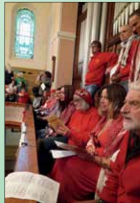
The Big Sing, Y Tabernacl Côr Cochion Caerdydd

We hope that message, sent loud and clear from Y Tabernacl, reaches those in power.