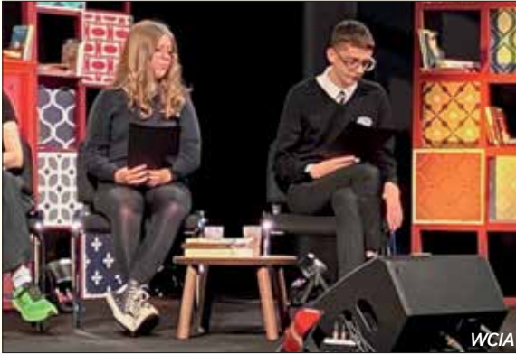
Young Peace Ambassadors take to the stage at the National Eisteddfod

As the Peace Tent this year was the focus of so many organisations, we are seeing the first step towards building a united front in Wales to work for peace and justice. CND Cymru must be ready to support this collaboration. We could look at the Wrexham Eisteddfod 2025 as an opportunity to grow and develop it.