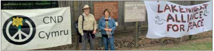
Activists from Wales show solidarity with LAP