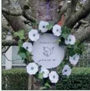
White poppies for peace, Aberystwyth